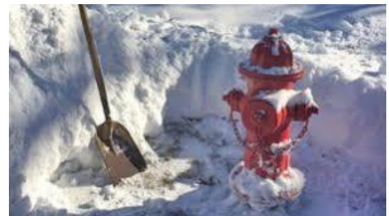
Clear a three-foot perimeter around the hydrants in your neighborhood.

Carver Public Services and Carver Fire Department would like to remind residents that it is very important to keep hydrants free from the obstruction of snow and ice. When shoveling or pushing snow off driveways, take time to clear the snow from around neighborhood fire hydrants, clearing at least a three-foot radius. During a fire, seconds count. The extra time spent removing snow from around fire hydrants may save your neighbor's home or your own.