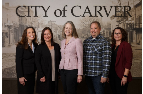
Carver City Council