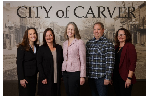
Carver City Council