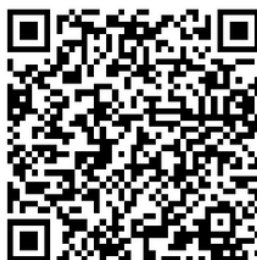
SCAN THE CODE